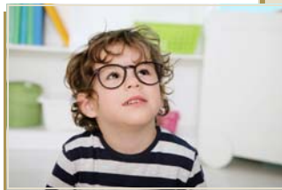
Eyeglasses for Adults and Children

Every donation makes a difference. Thank you!