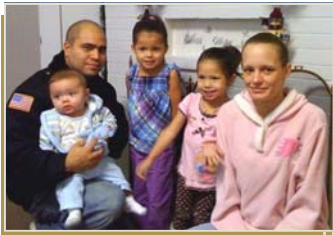
Emergency Utility Assistance

Interfaith Ministries provides basic needs assistance to individuals and families in northern Denton County. Our mission is to provide short term emergency assistance to the people of northern Denton County with the goal of helping those people to become self-sufficient.