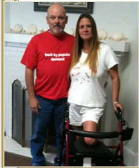
Emergency Medical Assistance for Adults

Interfaith Ministries' work is critical for many families whose lives are affected by job loss, medical emergencies, and the poor economy. We assisted 1,453 families (4,226 individuals) in Denton County in 2010.