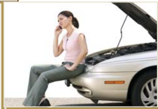
Public Transportation Assistance

We are counting on your support , as are those who depend on Interfaith Ministries' continued efforts. Please return your annual campaign donation by check or donate through Paypal online at www.ifmdenton.org .