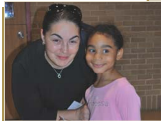
Emergency Rent/ Shelter Assistance

Our goal for 2011, is to raise $18,000, which will make it possible for Interfaith Ministries to continue to provide essential services and assistance to the ever-increasing population affected by financial crisis. We are currently at 71% of our goal.